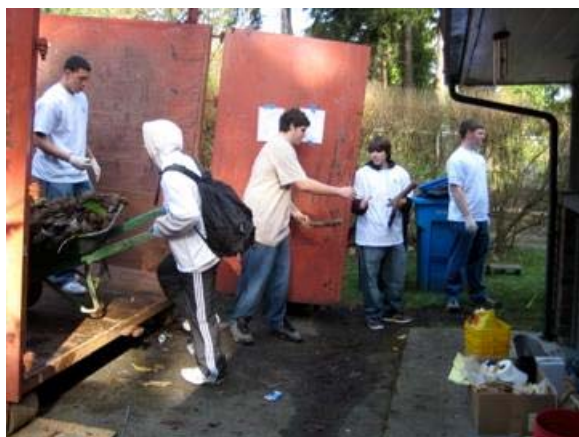
O'Dea High School students form assembly line to transport yard waste and trash outside a Parkview Services home in Shoreline.