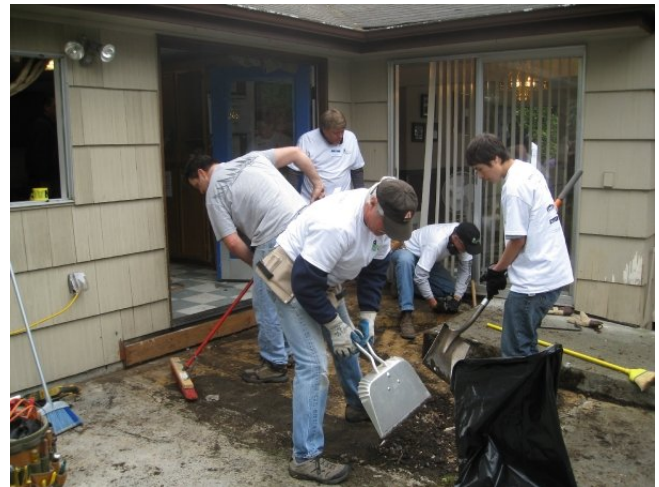
Volunteers from the Adobe, Panattoni, IFMA, and Kibble & Prentice teams demolish and build a new deck for the residents of a Parkview Services home in Lake City.